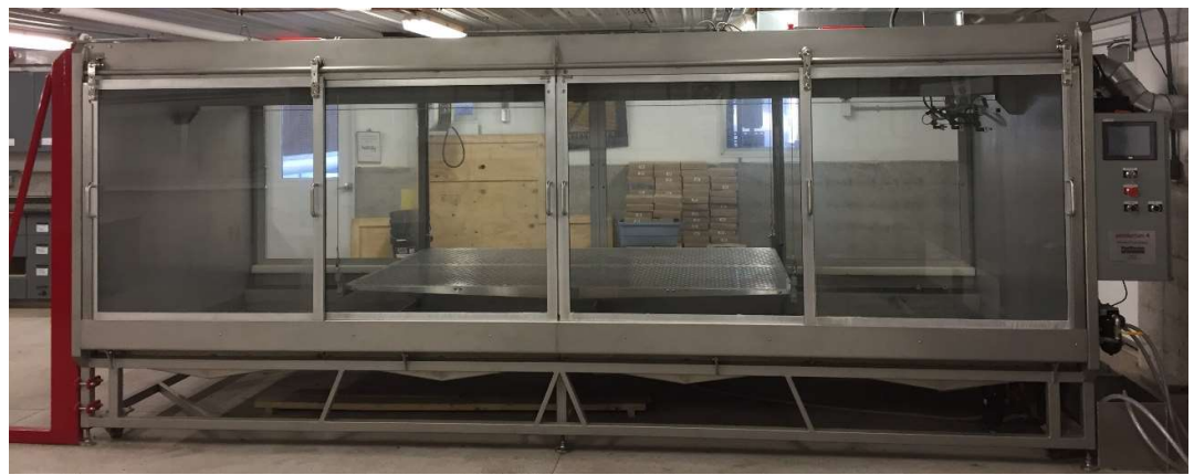
Figure 1. Three nozzle spray chamber located at the PAT lab used to apply treatments.