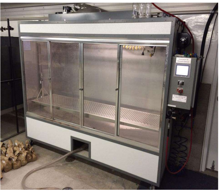
Figure 2. Single nozzle spray chamber located at the PAT lab used to simulate rainfall.